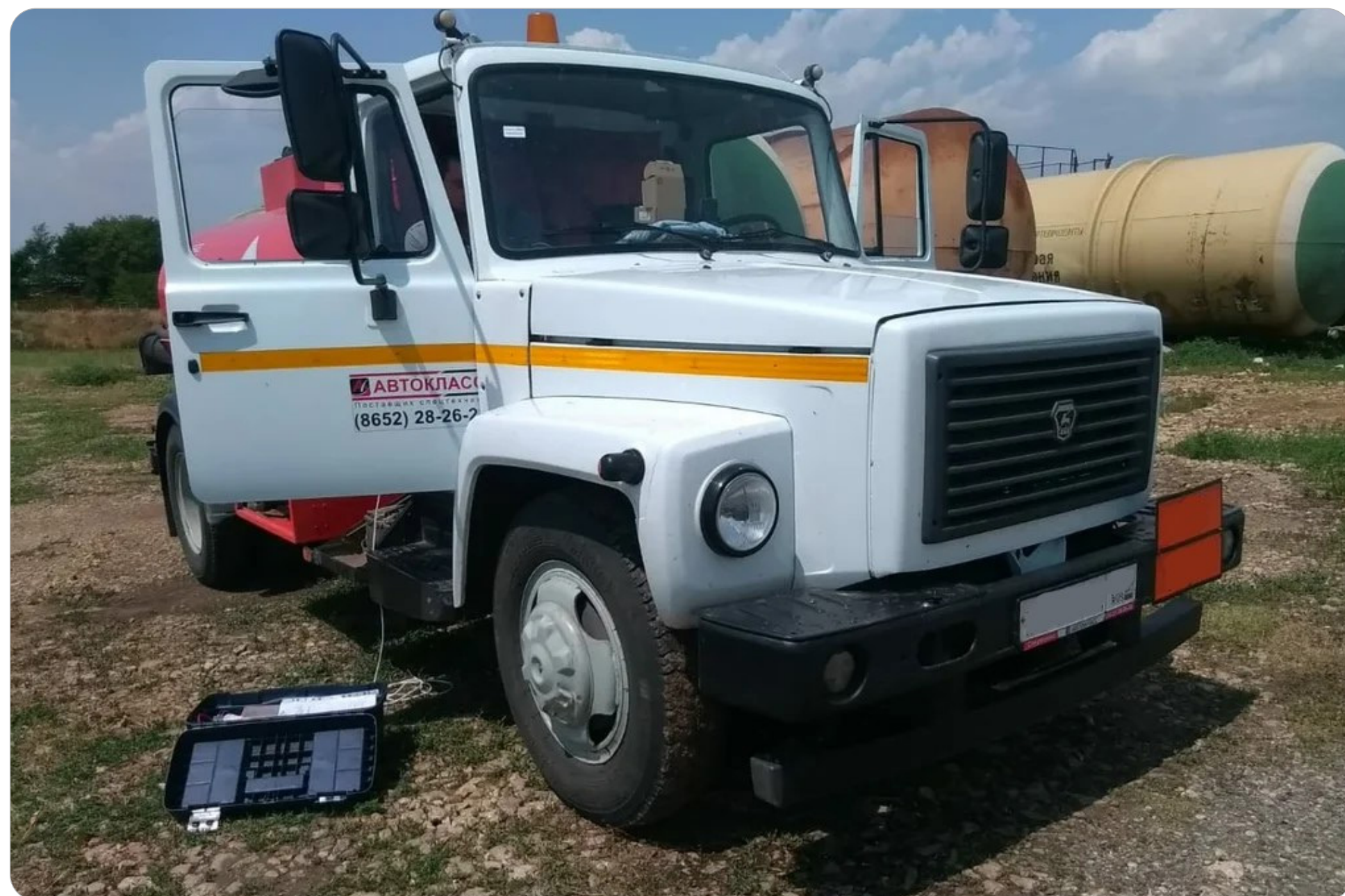
THE SOLUTION MONITORS EVERY LITER OF FUEL POURED INTO OR OUT OF A FUELING TRUCK

Knowing where the machinery is at the moment and what task it is fulfilling is useful for an agricultural enterprise, but it's not enough. Hence, Rostelematika's specialists offered the client Hecterra, a Wialon-based app for agribusiness. The app helps track the operations carried out in the fields, their quality, the amount of fuel spent; it also provides reports with summary data on field works.